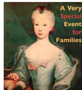
A Very Special Event for Families